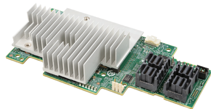
Intel® Integrated RAID Module RMS3AC160