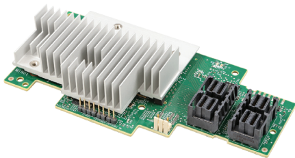
Intel® Integrated RAID Module RMS3VC160

12Gb/s SAS/RAID Modules for Select Intel® Xeon® Processor Based Server Boards